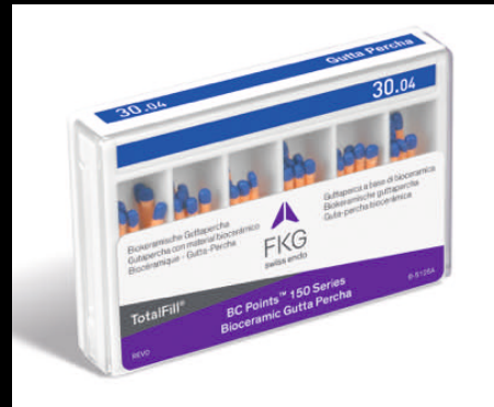
Total Fill® BC points