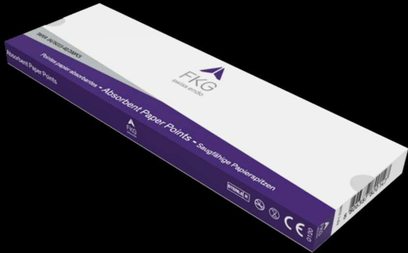
Sterile Paper points