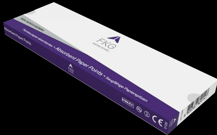
Sterile Paper points