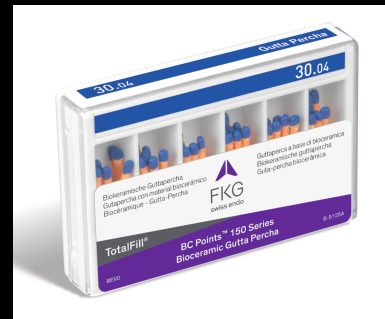
Total Fill® BC points