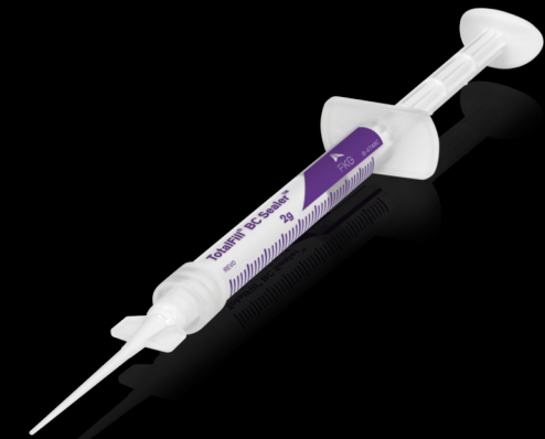
Total Fill® BC sealer